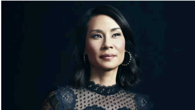
Lucy Liu